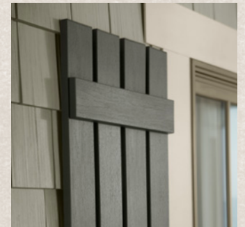
Ply Gem Shutters and Accents