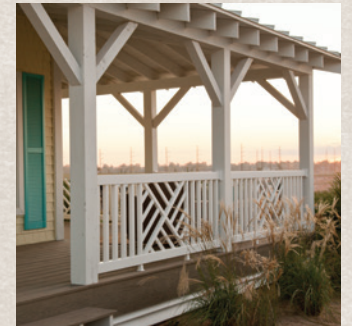
Ply Gem Fence and Railing