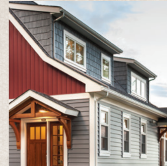
Vinyl Siding and Accent Panels

*Consult the VSI Website at vinylsiding.org for current list of certified products and colors.