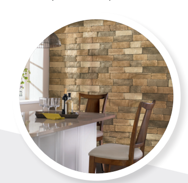
8 Keep going. When your space is complete, there's only one thing left to do. Stand back and admire