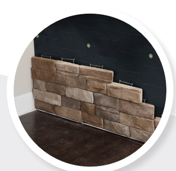
2 Continue putting your ClipStone piece up one at a time. Just like Except this time, it's you.