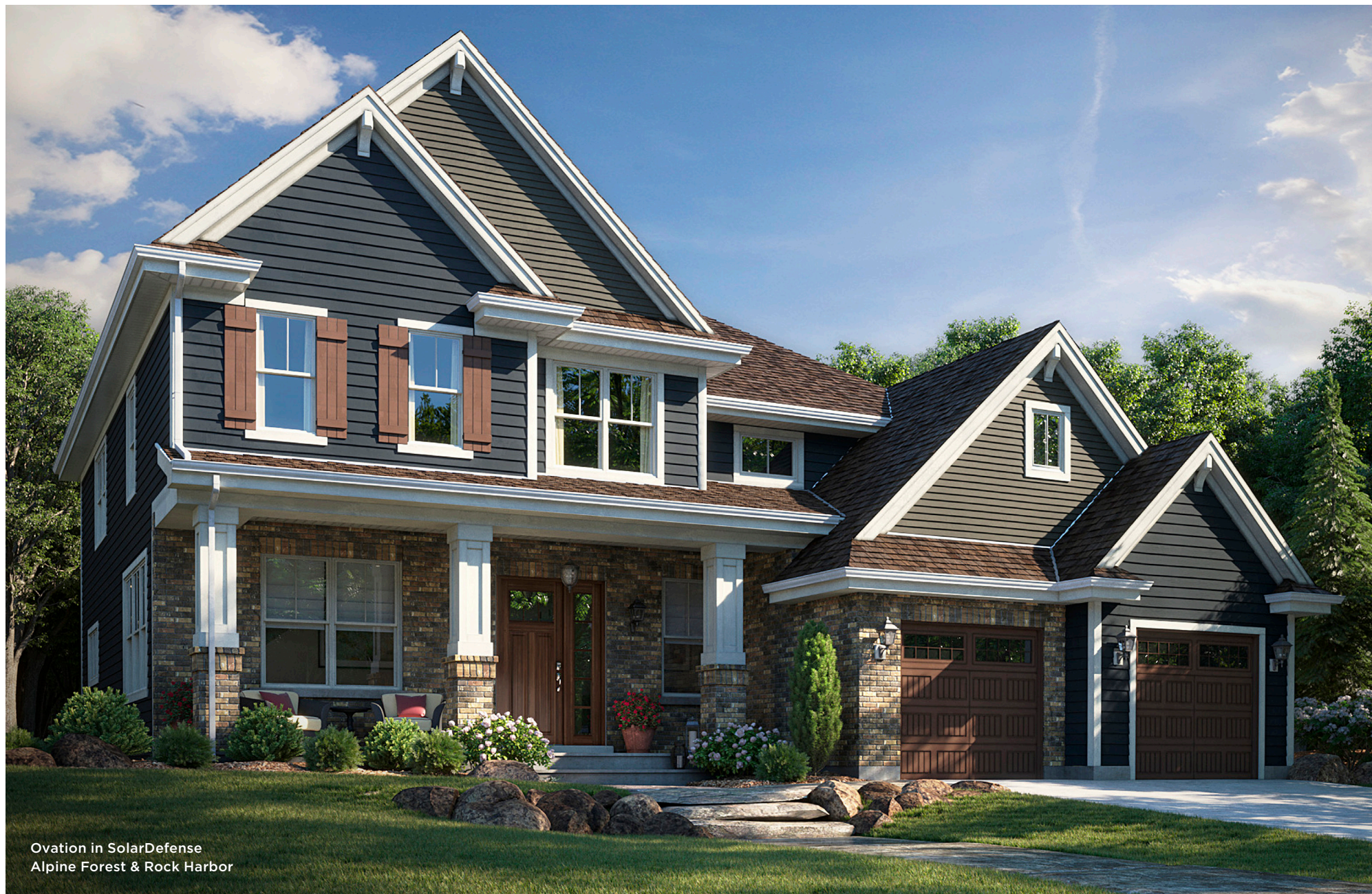
Ovation in SolarDefense Alpine Forest & Rock Harbor