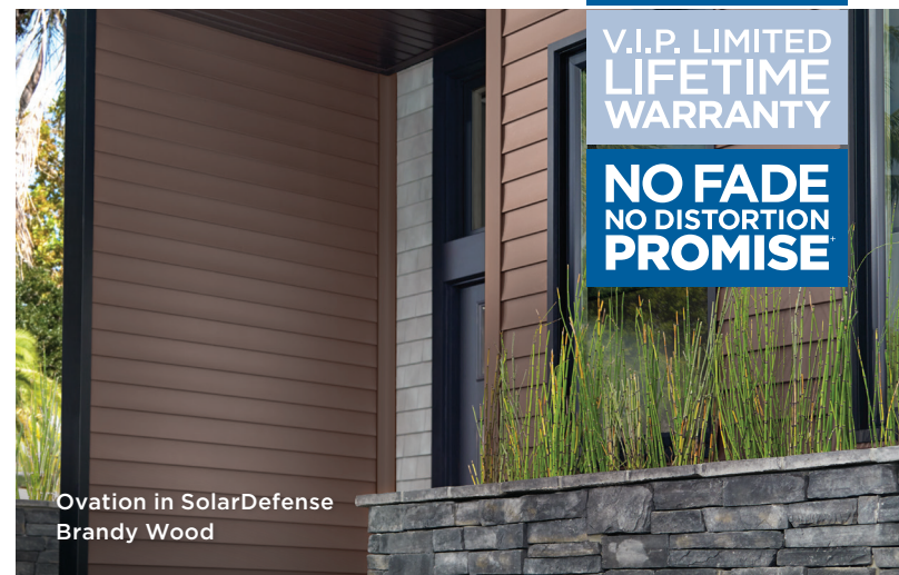
Ovation in SolarDefense Brandy Wood