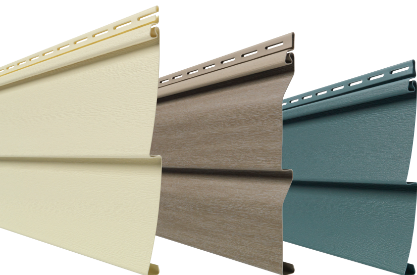
D5 DOUBLE 5" TRADITIONAL LAP

Quest® premium vinyl siding includes a tornado-tough, double-thick nail hem design to hold tight in the highest winds. It is virtually maintenance-free and beautiful season after season. And it's available in long lengths for fewer seams and a flawless look, even on larger homes.