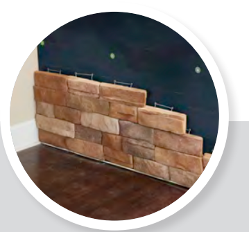
2 Continue putting your ClipStone piece up one at a time. Just like professional stone masons do. Except this time, it's you.