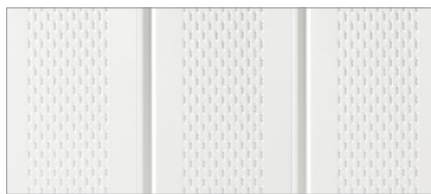
OTHER VENTILATED SOFFITS