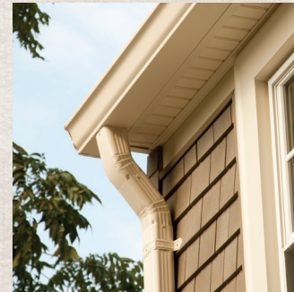
Rainware, Fascia, and Soffit