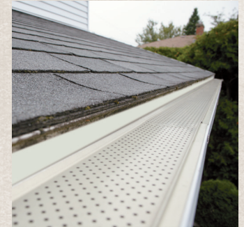
Ply Gem Gutter Protection