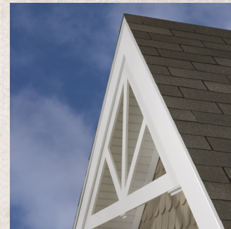
Ply Gem Trim and Mouldings