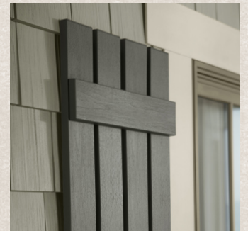
Ply Gem Shutters and Accents