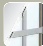
3/4" Flat, 5/8" or 1" Sculptured