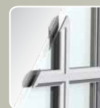
7/8" or 1-1/4" SDL with Shadow Bar