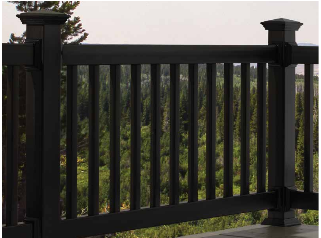
Black Standard Railing